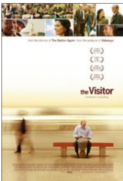
The Visitor depicts the plight of illegal freedom seekers in the U.S.

NON-PROFIT ORGANIZATION U.S. POSTAGE PAID INDUSTRY, CA PERMIT NO. 4386