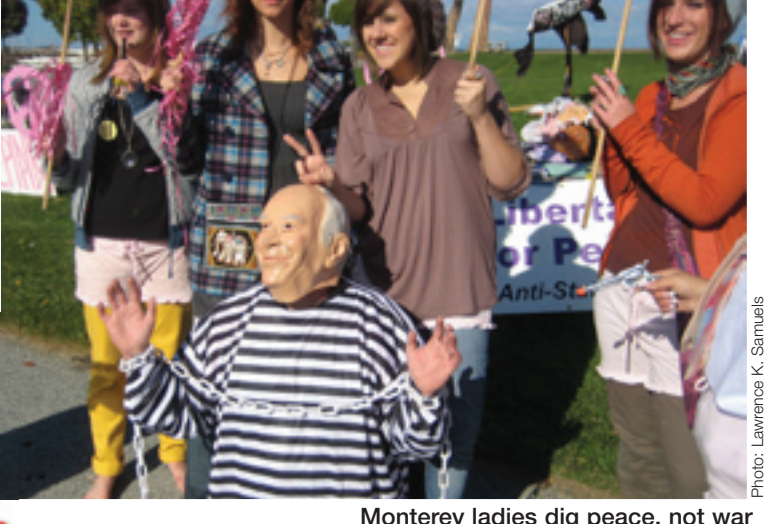
Monterey ladies dig peace, not war