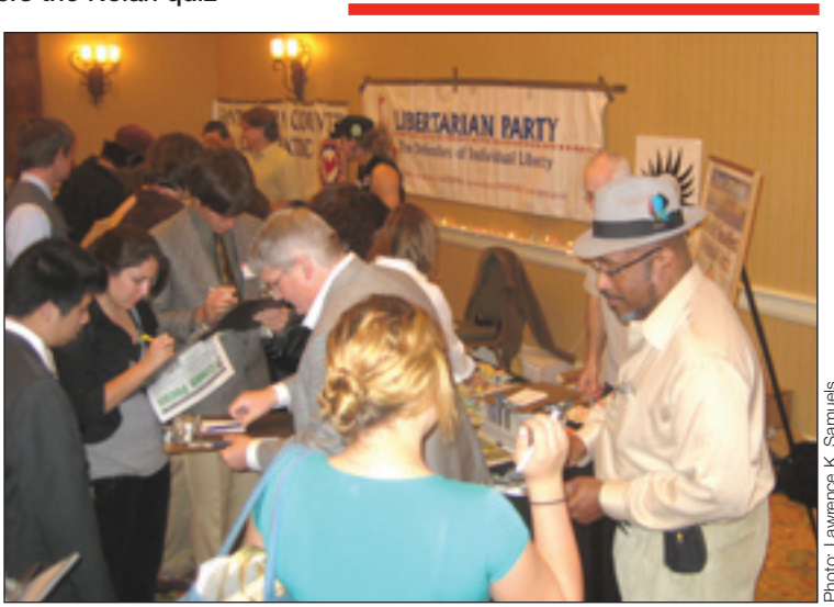
Young people crowd the Libertarian table