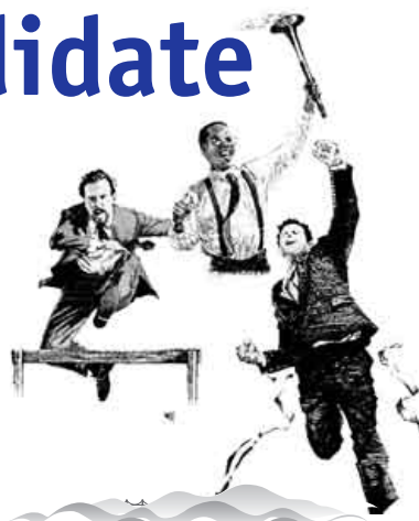
LPC Convention 2007 - April 20-22 - San Ramon LIBERTARIAN SUCCESS