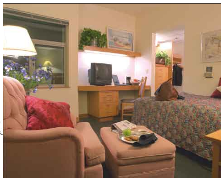
• A typical guest room at the San Ramon Valley Conference Center. Guest rooms are comfortable singles.