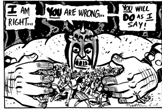
Cartoon by Batton Lash, www.exhibitpress.com

The best road to peace is to allow citizens to structure their own lives.