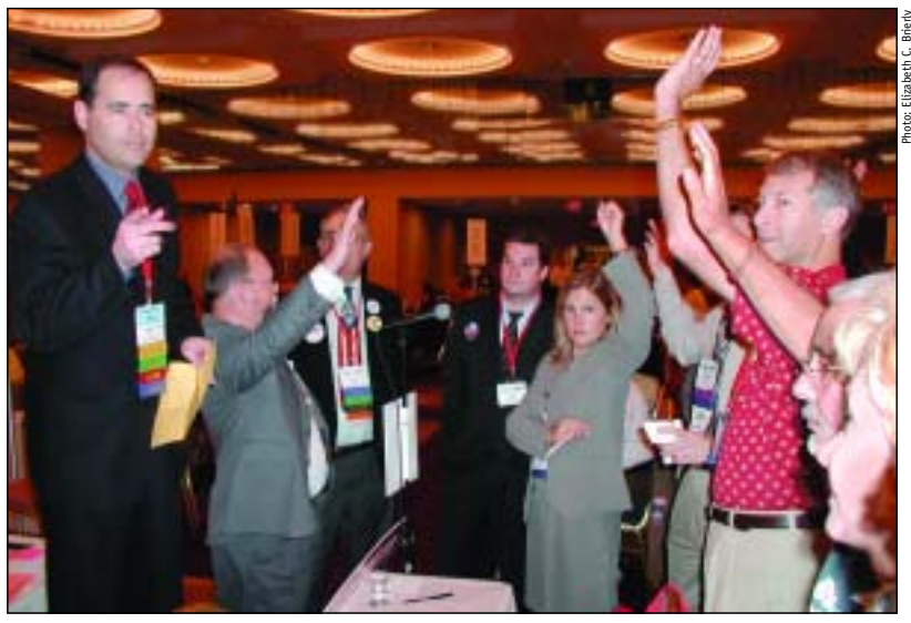
On the convention floor, LPC delegates hold a quick vote to credential a fellow delegate,

The national LP convention is the ideal occasion at which to renew our resolve, to share what's working in our state and what's not, collect great ideas and new ways of looking at our issues and goals, and to just plain have fun.